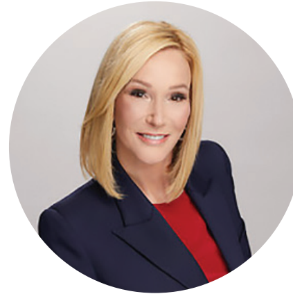
PAULA WHITE-CAIN CHAIR, CENTER FOR AMERICAN VALUES

The core of American government is, as the Declaration of Independence states, “to secure these rights”—namely, “life, liberty, and the pursuit of happiness.” Today, a dizzying array of ideas and influences counter to foundational American Values threaten our inalienable rights and our democratic republic system of government. America First Policy Institute’s Center for American Values will advance messaging, policies, and litigation that respect and protect life, uphold God-given liberties, preserve freedoms of expression, and restore basic ideals and values that propel a prosperous society. In the same vein, the Center for American Values also features the “Second Chances Project,” which aims to address America’s incarceration problem through a faith-based lens and confront the root causes of crime: broken families and a lack of faith.