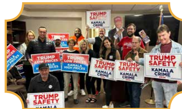
3,500 canvassers across 8 states

Led by Kellyanne Conway and Hogan Gidley, we have published 28 key documents to equip our partners with persuasive narratives on essential policy issues.