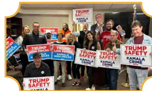
3,500 canvassers across 8 states