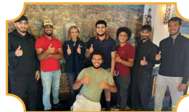
29+ million texts sent