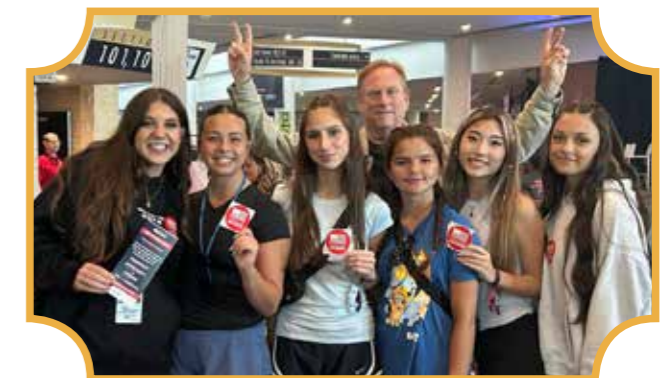
752,000 voter surveys completed