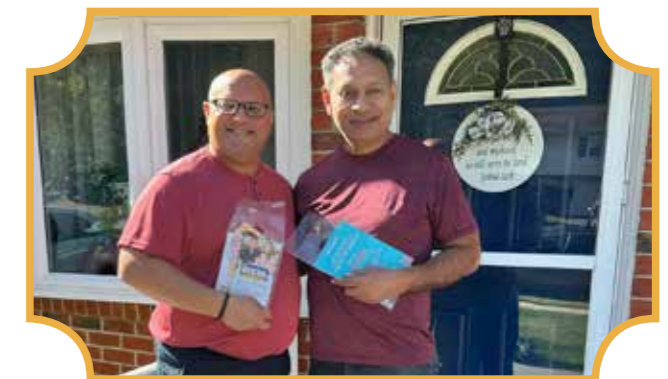
5.7 million doors knocked